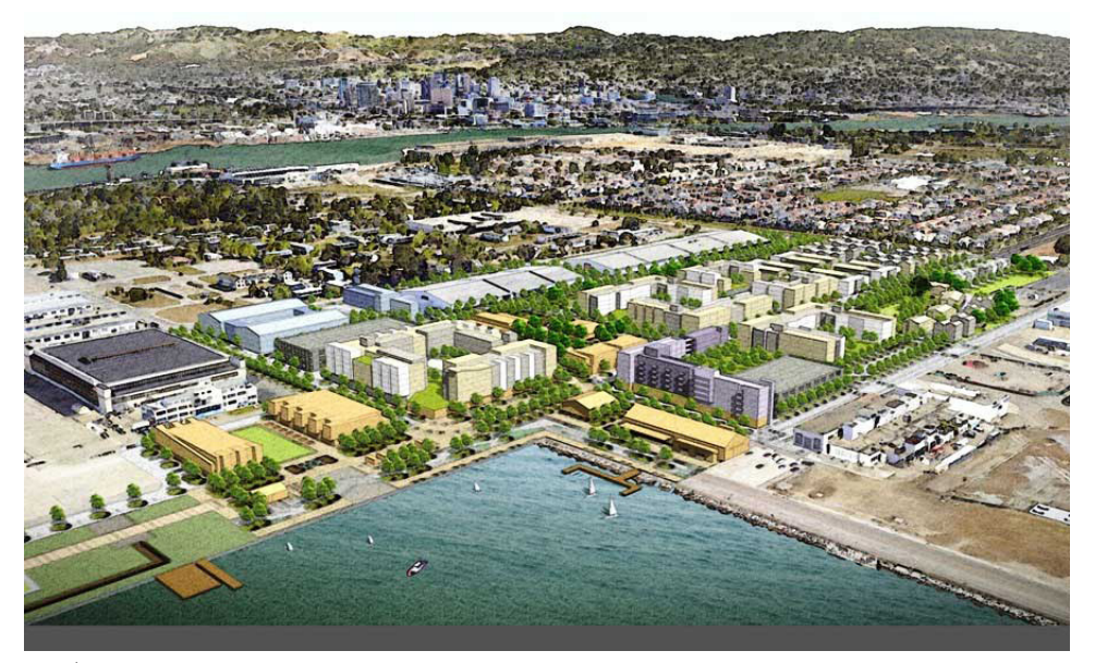
The $500-million first phase of Alameda Point Site A is set to break ground

City leaders and others celebrated a milestone Wednesday when they gathered to ceremoniously put shovels into the ground on a $500 million project to transform part of the former U.S. Navy base now known as Alameda Point into housing, shops and offices.